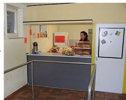
There are normally quite some queues in the school cafeteria.